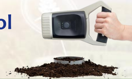
Soil Fertility Status Table